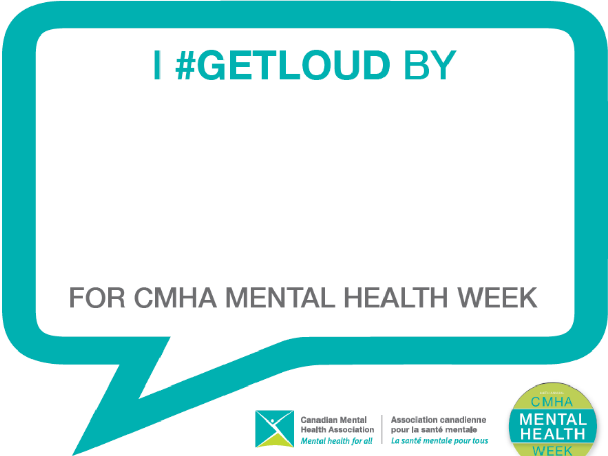
Sample image. Please click to access original file.